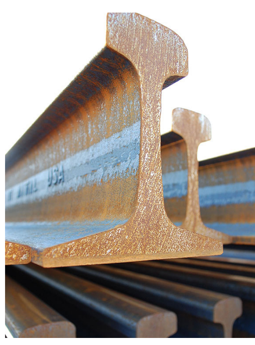
1262 Rev 4